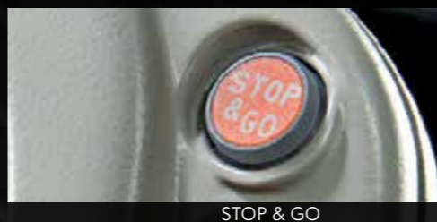
STOP & GO