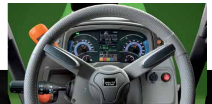
NEW DASH DESIGN