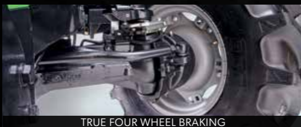
TRUE FOUR WHEEL BRAKING