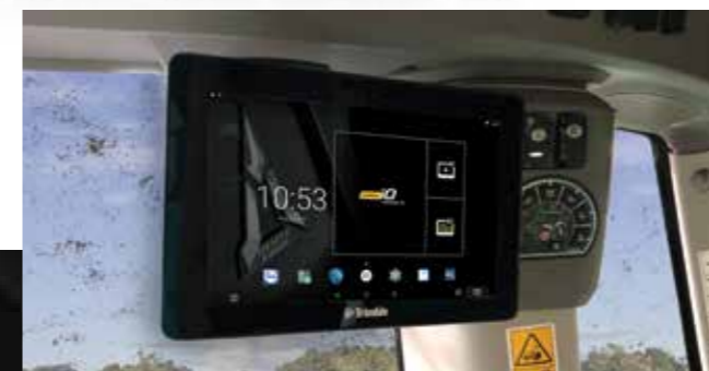
TRIMBLE IN THE MAXIVISION CAB