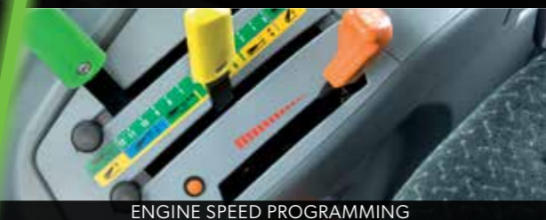
ENGINE SPEED PROGRAMMING