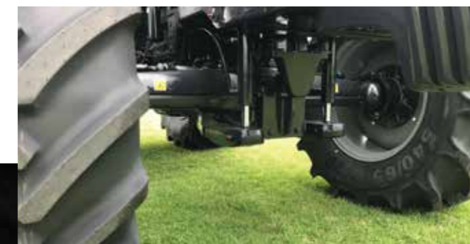
FRONT AXLE SUSPENSION

AGROTRON 6205G POWERVISION 50 KM/H RC-SHIFT