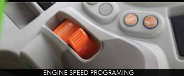
ENGINE SPEED PROGRAMING